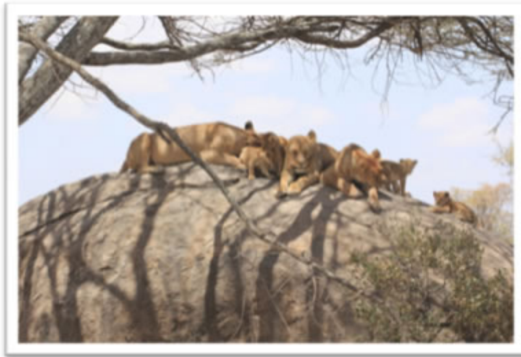
Lion taking nap at noon time

Day 5 (21 Aug): Lake Naivasha - Lake Nakuru National Park – Lake Naivasha Wake up to an early breakfast then drive to Lake Nakuru National Park with picnic lunch. Arrive in time for midmorning game drive. Lunch will be had a scenic spot overlooking the beautiful Lake Nakuru. After a short rest we will enjoy more game viewing then drive back to Naivasha. O/N Naivasha.